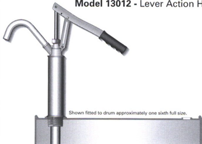
Model 13012 - Lever Action Hand Pump.